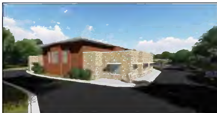
Rendering of the Epstein Family Chabad Center for Jewish Life

There will be a recognition ceremony with an expression of appreciation to the major donors of the new building, including