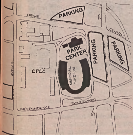
Park Center is just on the downtown side of Memorial Stadium.

shorter routes, but none simpler and less time-consuming. From U.S. 74 East So you're coming in from Wilmington, or Rockingham, or Monroe? Okay. U.S. 74 becomes Independence Boulevard. After getting into the city limits, you'll go about five miles before passing the Coliseum on your left. Now listen up good. About a mile and a half after the Coliseum, you'll see a Kentucky Fried Chicken on your right at the Independence-Plaza intersection. Get in the right lane as soon as you can. Two traffic lights further, you'll be at the Independence-Hawthorne intersection with a Krispy Kreme on the left. Do