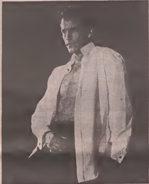
Clothing manufacturer Eton of Sweden has designed a man's shirt for those who want to make a statement about AIDS with-

Republicans for Individual Freedoms (RIF) wants to start a chapter in the North/South Carolina region. RIF presently has chapters in New York, Hartford and Atlanta with over 200 members nationwide. RIF was begun to fight homophobia in the Republican Party and to fight "Republiphobia" in the gay community. They organize meetings and rallies, letter writing campaigns and issue policy papers. Chapters have three main areas of responsibility: 1) speak out when Republicans make homophobic statements, 2) hold Democrats accountable for campaign promises to the gay community and 3) insist that gay leaders represent all gay citizens. For membership information, contact Republicans, PO Box 13162, Atlanta, GA 30324.