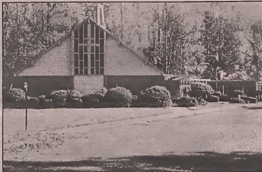
MCC Charlotte's soon to be new church home located at 1825 Eastway Drive next to Methodist Home Park

people for future endeavors and diverse participation as a gathered community. It is a vision that speaks to a place where people of all "likenesses" will find a source of affirmation, strength, safety, and empowerment. It is a vision that speaks of a place from which all else flows.