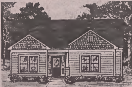
The Midwood - 1070