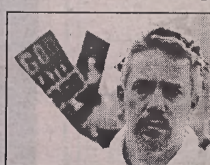
Journey to a Hate Free Millennium