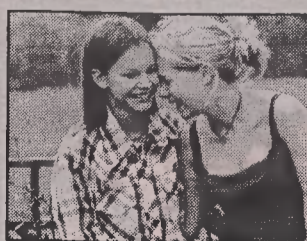
Show Me Love