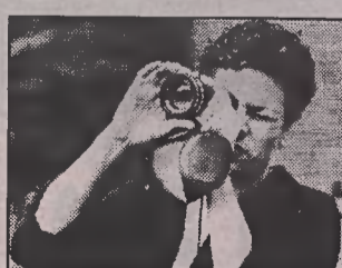
Bedrooms and Hallways