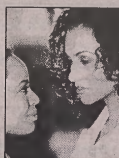
A Luv Tale

Also Showing: The Night Larry Kramer Kissed Me • The Deal • Set Me Free • But I'm a Cheerleader • Psycho Beach Party • Rick & Steve, the Happiest Gay Couple in All the World • Pink Narcissus • Twisted • Just One Time • Aimée & Jaguar • Criminal Lovers • Paragraph 175 • Chutney Popcorn • Johnnie Greyeyes • Fun in Men's Shorts (Short Subjects)