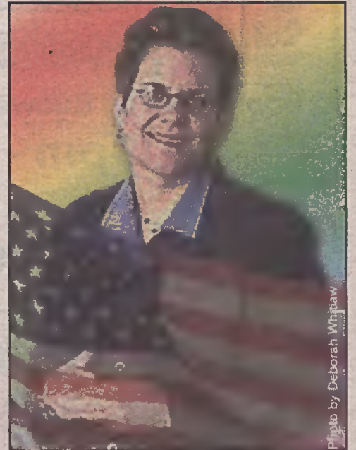
Cathy Woolard, Atlanta Council President

The Atlanta Journal and Atlanta Constitution both endorsed Woolard. The Constitution said: "She has demonstrated the kind of leadership the council president's job demands, as well as the inclusiveness and collaboration a new relationship between the mayor and council will require. Woolard as council president is what the city needs now."