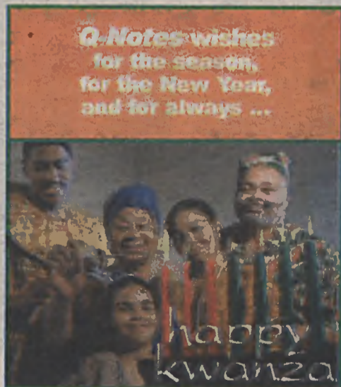
Q-Notes wishes for the season, for the New Year, and for always ...