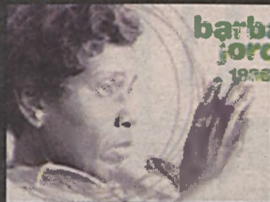
barbara jordan 1929-1966

"What the people want is very simple. They want an America as good as its promise."