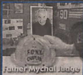
Father Mychal Judge