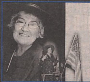
Bella Abzug's words and deeds live on in us all