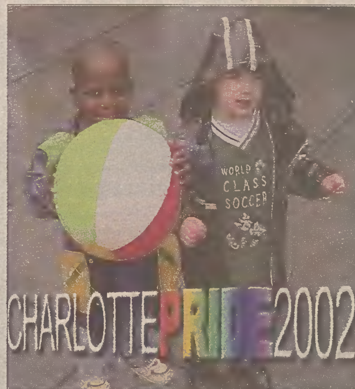
Celebrating Families was theme of 2002 Charlotte Pride. What do you do when it rains on your parade? Bring a beach ball, silly. Two happy fellas in Uptown Charlotte.