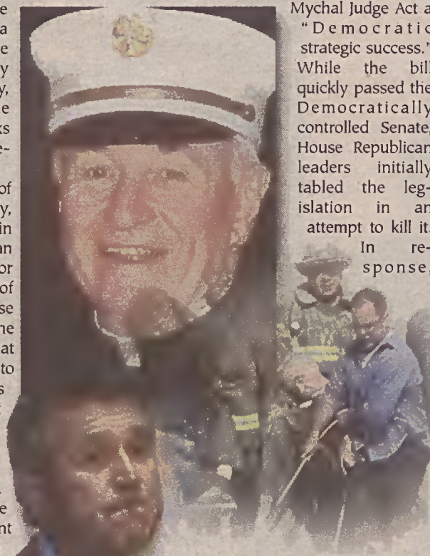
Father Mychal Judge, top and then as he was carried from the World Trade Center on 9-11; and President Bush

The new law is named for Catholic priest, Father Mychal F. Judge, the New York Fire