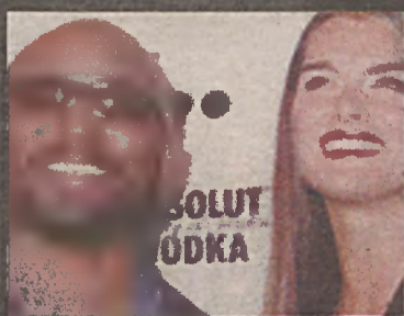
GLAAD honors supportive activist stars