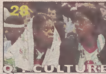
Sandra Bernhard burns down the house for AID Upstate benefit in Greenville