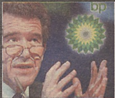
Sir John Browne, CEO of British Petroleum — world's largest oil company — fuels the fires for ENDA