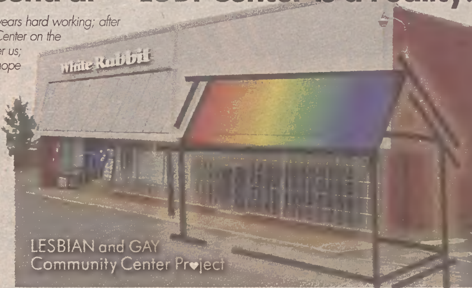
Right next to the White Rabbit Books & Things, Charlotte's new Community Center will open later this year.