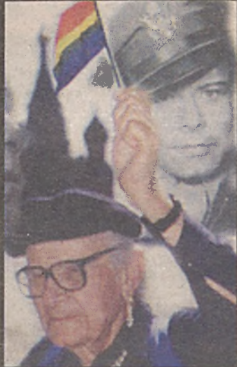
Harry Hay, Dad & Grandad of Gay Liberation, dies 11

¡Para Todos! 13 columna nueva en español