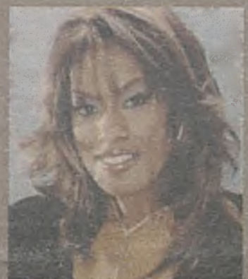
Jennifer Holliday joins The Charlotte Symphony in concert Jan. 24 and 25 26

Mancini Foundation awards grants LGBT groups 4