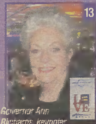
13 Governor Ann Richards, keynote: Human Rights Campaign 2003 Carolina Dinner