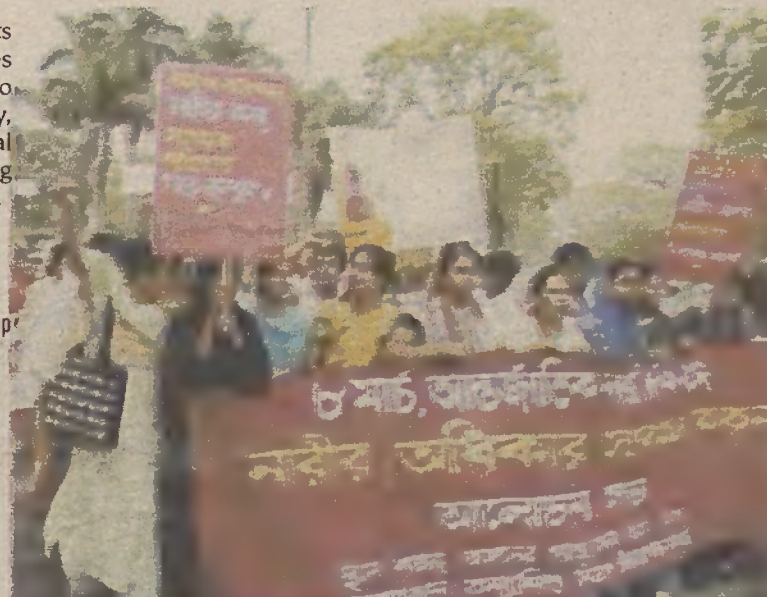
no matter the language, the message is clear