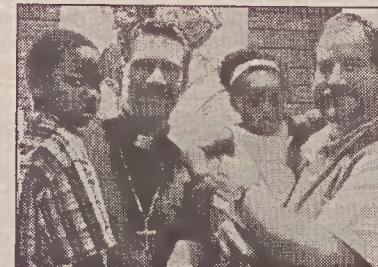
The Hinson family