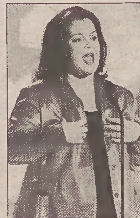
Rosie O'Donnell lends her voice to The Advocate .

voice. The publisher, Gruner + Jahr USA, sued her for leaving.