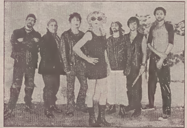
The cast of the Actor's Theatre production of Hedwig and the Angry Inch .