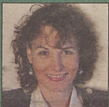
Transgenders under scrutiny from Homeland Security