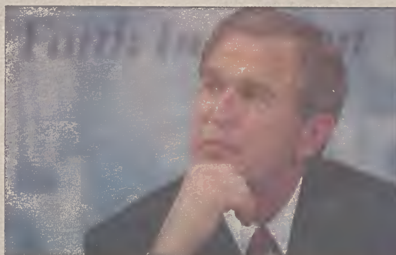
Despite protests from LGBT organizations, President George W. Bush endorsed 'Marriage Protection Week.'

But opponents were not placated by such political maneuvering.