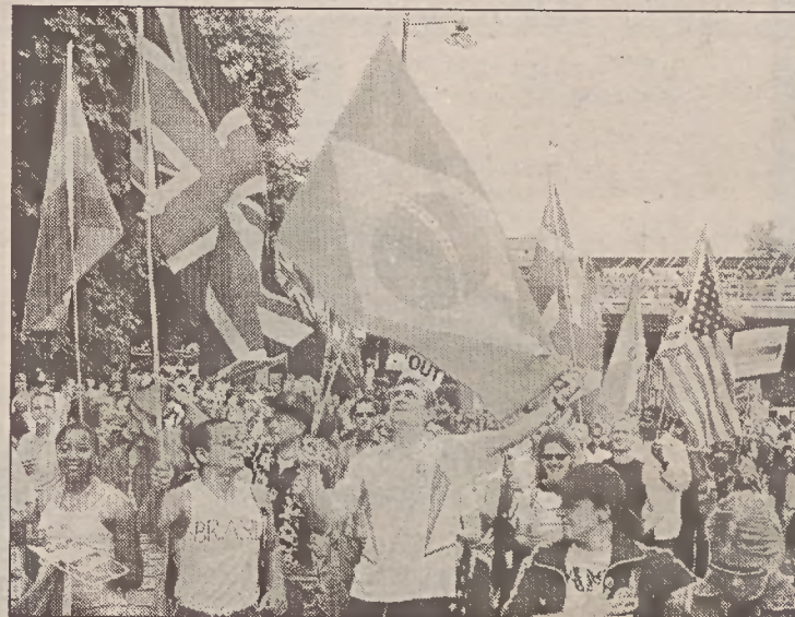
Approximately 70,000 partied in Hyde Park at London Pride 2003.

Caveat: Now that you're jazzed for your London getaway, here's the lone drawback: The exchange rate isn't ideal — one pound is worth about $1.60 these days. (For the math challenged this means one would have to exchange $800 to pocket 500 pounds) But, as we established in the beginning, we're