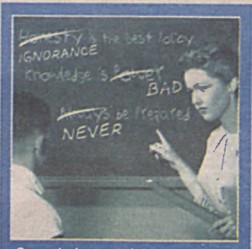
Sex ed classes giving false info

Win $50 from Q-Notes! See page 3 for details.