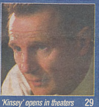
'Kinsey' opens in theaters