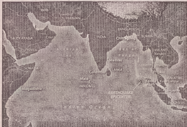
The effect of the tsunami that originated from an earthquake off the coast of Indonesia was felt as far away as India and Thailand.

In Indonesia, gay groups have been unable to get any information from the most-affected areas.