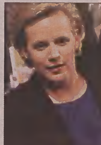
Mary Cheney signed with Simon & Schuster's new "conservative division."

Mary Matalin, a Republican political strategist and the head of the Simon &