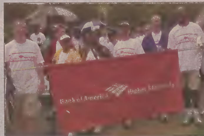
Bank of America organized an employee group to participate in AIDSWalk 2004.

CHARLOTTE, N.C. — Regional AIDS Interfaith Network's (RAIN) annual AIDSWalk Charlotte will take place Saturday, May 7, 2005 at