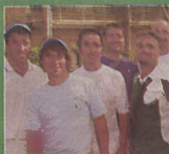
Playin' It Out: Queen City Tennis Club wins in Orlando