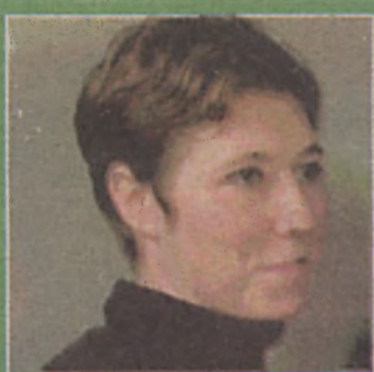
Martha Wainwright debuts new album