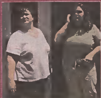
Cherokee Nation okays lesbian union