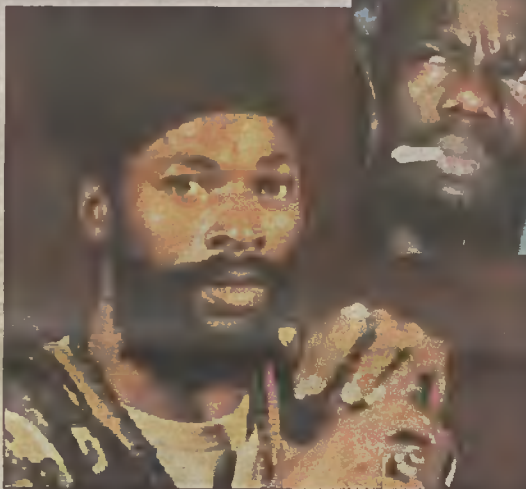
Capleton and Sizzla will take to the stages of Raleigh and Charlotte — despite protests by LGBT rights groups last year.

CHARLOTTE — Despite a protest last Oct. 20 at Amos' Southend in Charlotte when reggae/dancehall artist Capleton showed up — and continued cancellations