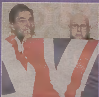
Brit comic duo takes U.S. by storm