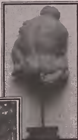
Crouching Back With Hands Campbell Paxton polymer clay terra cotta sculpture