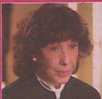
Lily Tomlin on life and everything else