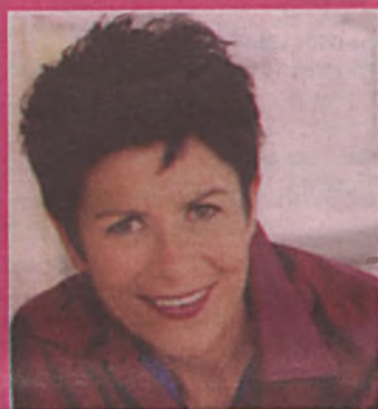
Kate Clinton comes to Triangle