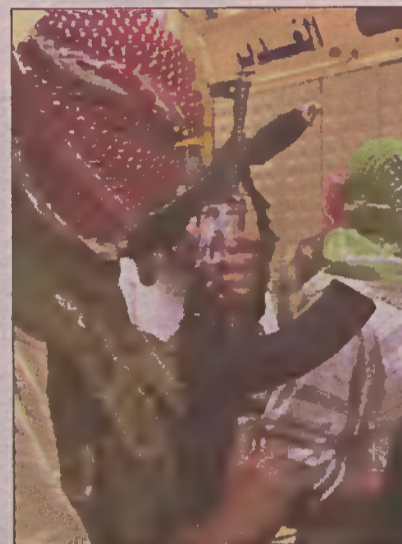
Shia death squads — following the orders of Ali Al Sistani — are murdering gays and lesbians in Iraq.

"Badr militants are entrapping gay men via internet chat rooms. They arrange a date and then beat and kill the victim. Males who are unmarried by the age of 30 or 35 are placed under surveillance on suspicion of being gay, as are effeminate men. They will be investigated and warned to get married. Badr will typically give them a month to change their ways. If they don't change their behavior, or if they fail to show evidence that they plan to get married, they will be arrested, disappear and eventually be found dead. The bodies are usually discovered with their hands bound