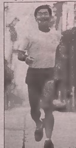
Openly gay actor George Takei will embark on a tour to promote dialogue on LGBT Americans.