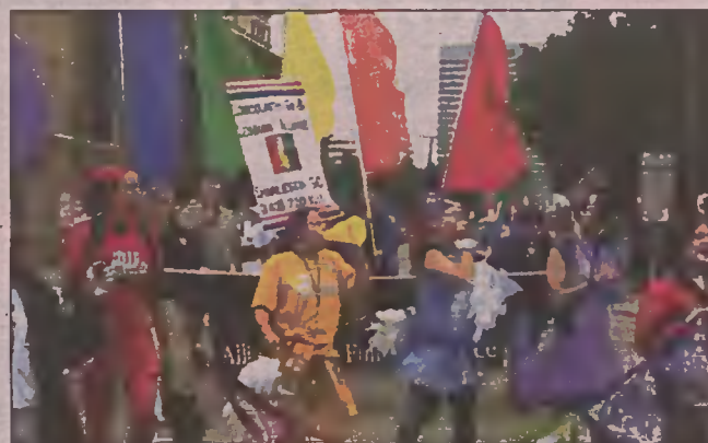
Revelers in Pride March '05.

"This festival has been around for 15 years now, continuously growing and we're