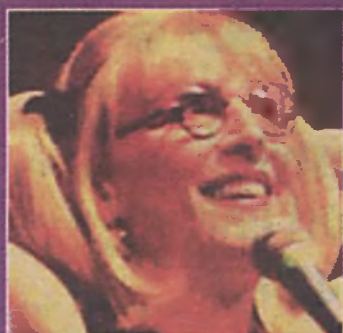
Kate Bornstein comes to Charlotte