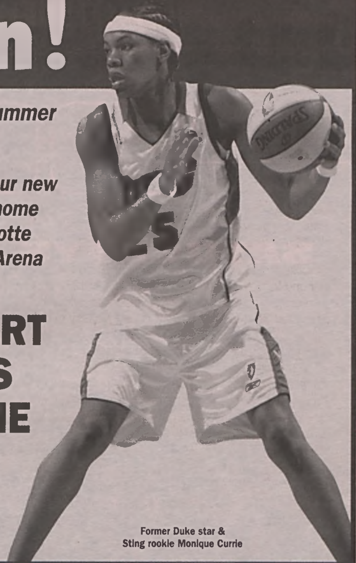
Former Duke star & Sting rookie Monique Currie