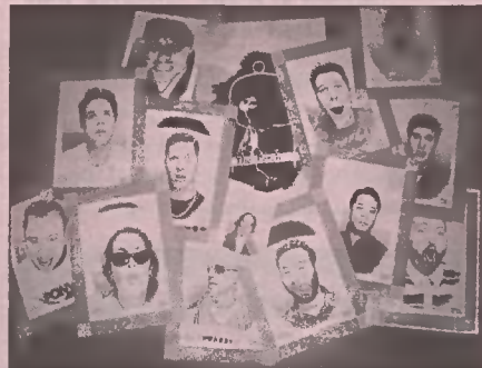
The Perch cast have been 'cheerfully offending since 1994.'

be a greatest homo hits kind of thing, as the cast resurrects its best gay material from over the years. Admission is $12 per person. Proceeds from the shows will help fund PRIDE Charlotte 2006, to be held Aug. 26 at