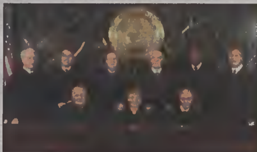
The S.C. Court of Appeals overturned a prejudiced lower court ruling.