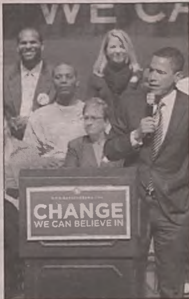
Barack Obama spoke at Greensboro, N.C.'s War Memorial Auditorium on Mar. 26.

CHARLOTTE — Sens. Hillary Rodham Clinton and Barack Obama are campaigning across the state. On Mar. 19 Obama stopped in Fayetteville, home to Fort Bragg, and the Grady Cole Center in Charlotte, Obama's remarks focused mainly on the nation's prolonged presence in Iraq and other Middle Eastern nations.