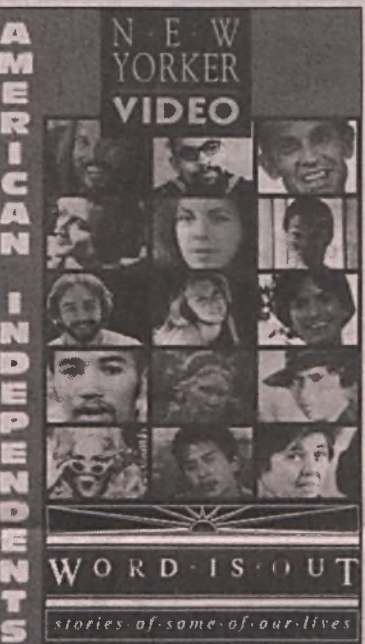
'Word Is Out' (1977) was the first documentary feature by gays and lesbians talking about their own lives.