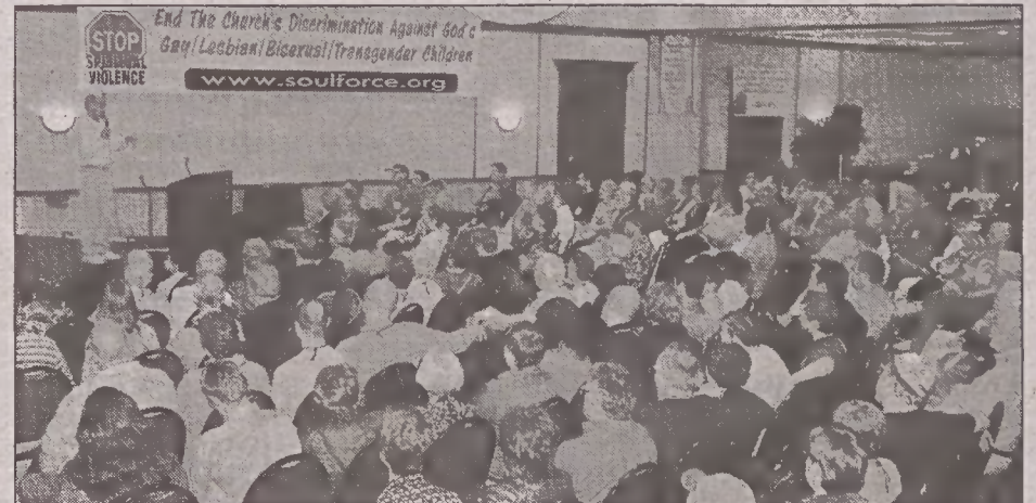
Although some Methodist ministers are breaking the Book of Discipline to bless same-sex unions, the denomination is holding fast to its traditional stands. Soulforce, an interfaith organization working to combat religious prejudice, gathered for their own 10 year anniversary, conference and direct action in Ft. Worth, Texas, at the same time as the United Methodists convention.