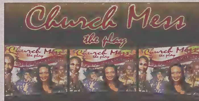
The ministry leaders producing the anti-gay 'Church Mess' hold skewed and dangerous views of the HIV/AIDS issue.