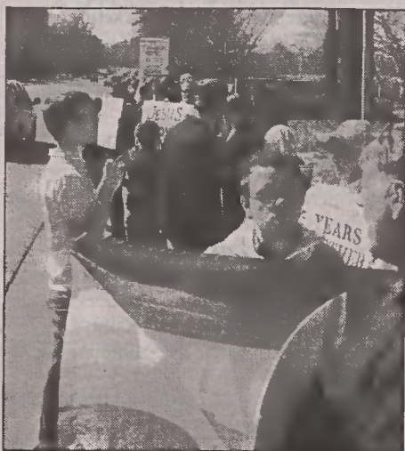
LGBT and straight ally community members protest outside Central Church of God.

CHARLOTTE — A crazy month full of LGBT activity in the Queen City has come and gone. For LGBT activists and community members, February was nothing short of a full-fledged queer extravaganza, including a