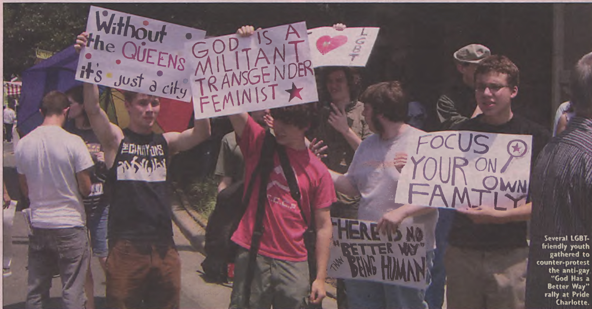
Several LGBT-friendly youth gathered to counter-protest the anti-gay "God Has a Better Way" rally at Pride Charlotte.