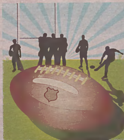
Illustration Credits: Rugby, duchessa, via rgbstock.com Softball, sport-kid.net.

Charlotte's Only Exclusive Piercing Studio