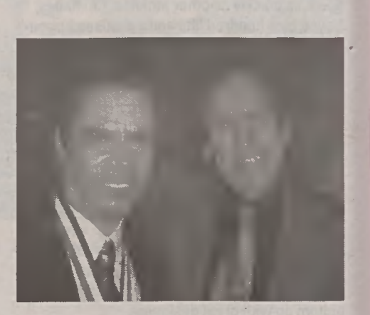
Me with Rudy Galindo at his induction ceremony into the U.S. Figure Skating Hall of Fame in 2013.

Rudy Galindo. This skater of Mexican descent overcame economic and personal