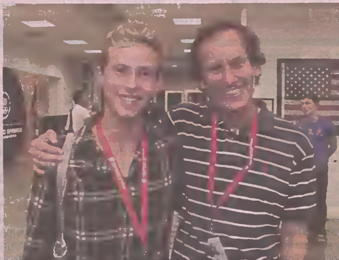
I got to meet one of my all-time favorite skaters, the strikingly handsome and current U.S. champion Adam Rippon, when I won the U.S. Figure Skating trip to Champs Camp in 2013.

Brian Orser has now gone on to be one of the most successful international coaches on the planet, having coached two Olympic champions (Yuna Kim of Korea and Yuzuru Hanyu of Japan) and currently coaches the top two men in the world (Hanyu and Javier Fernandez of Spain.)