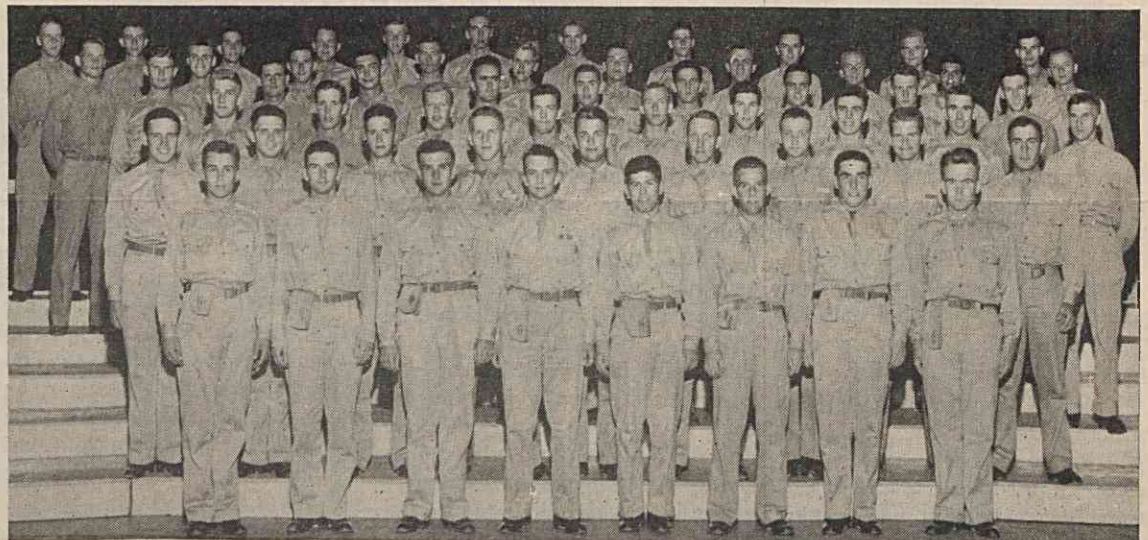
THE PERSONNEL may change, but the U. S. Navy Pre-Flight Glee Club continues to receive praise wherever it performs. The Chaplain's column in this issue is devoted to the work and purpose of the club.