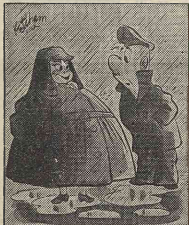
"I'm really quite slender. It's just that I want to keep all my War bonds from getting soaked."

In Class Athletics the 52nd was in front with 75 points. The 53rd was next with 50, the 54th third with 25, the 56th fourth with 10, and the 55th, in last place, had no points to their credit.