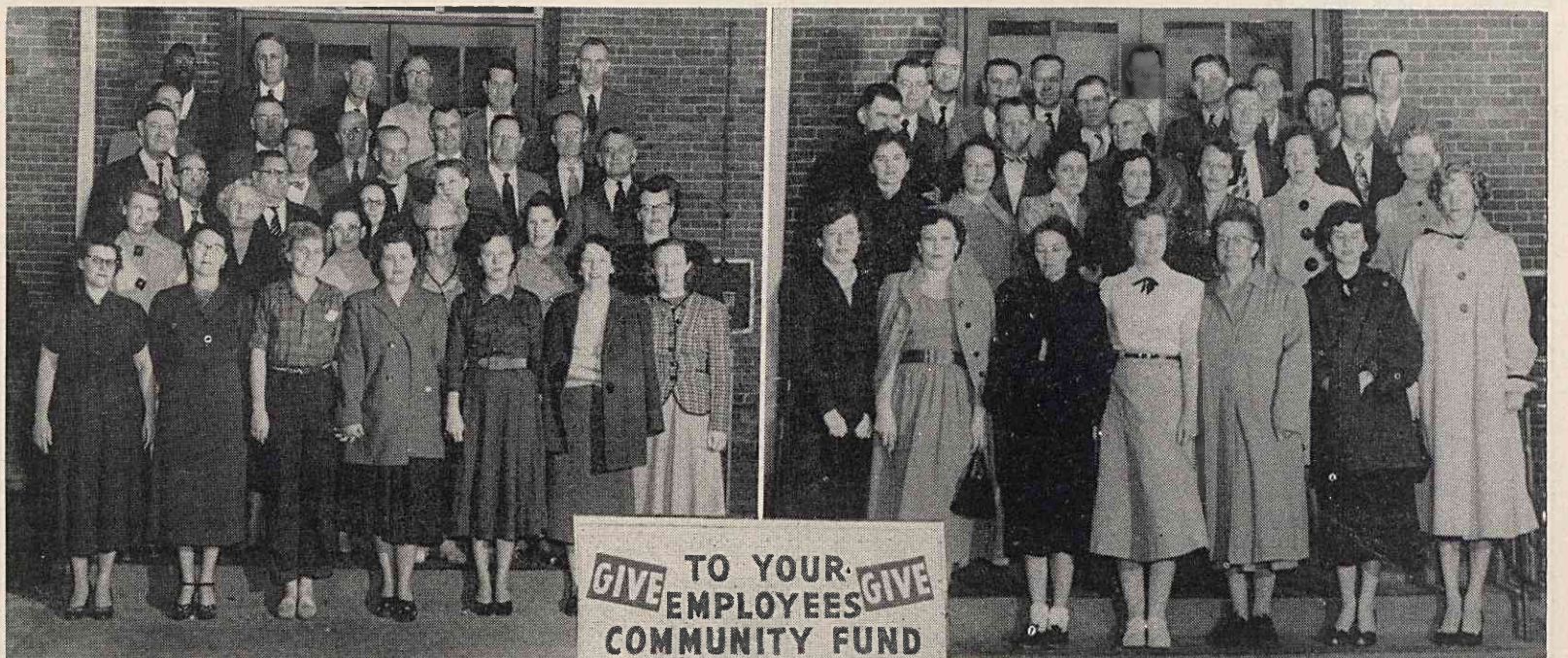
THIS is the group of solicitors who helped raise more than 11 thousand dollars in the first Community Fund Drive last January. A similar group will conduct the United Fund Drive, of which the Community Fund is now a part, starting November 9.