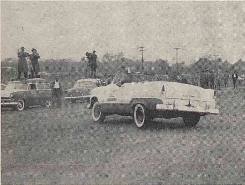
MOVIE MEN and still photographers themselves saw a great deal of action as they caught the fast-moving demonstrations on film. Automotive editors and other writers from newspapers, wire services, magazines, radio and television are shown too as they watched the tests with Firestone officials.