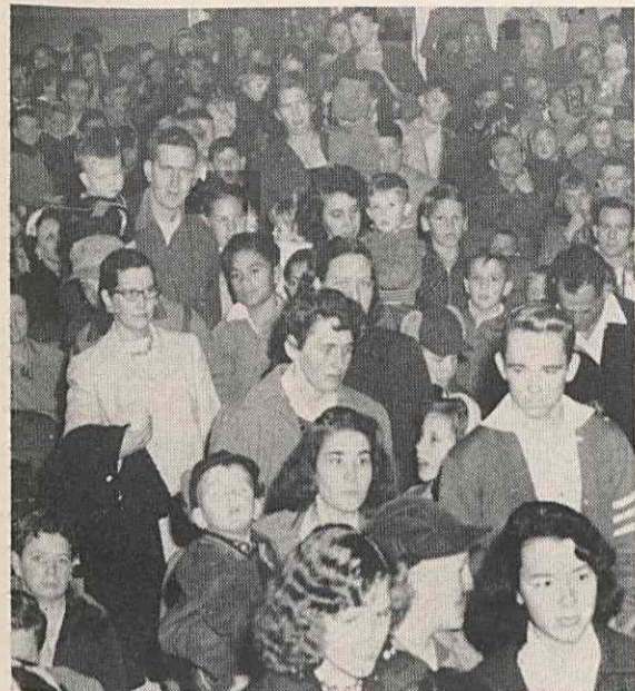
Firestone guests at the Webb and Palace theatres saw a movie before Santa arrived.

gifts. For those children of employees who were unable to attend one of the theatre parties, presents were distributed Saturday afternoon at the personnel office of the plant.