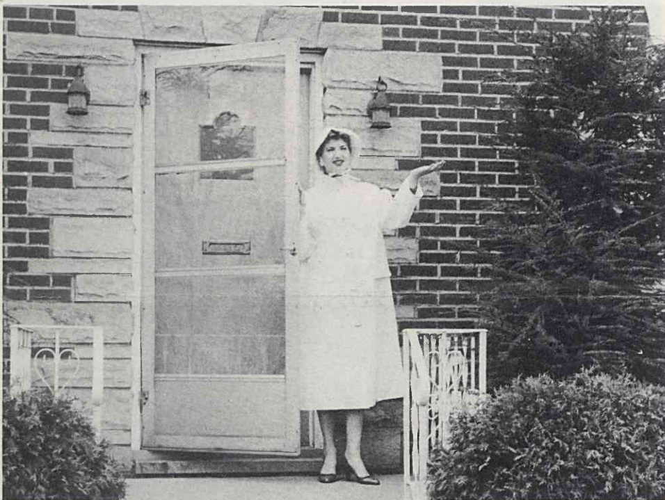
IN PLASTICS during the year products introduced included improved rigid Velon sheeting and additional Exon vinyl resin compounds. Here a model shows a raincoat and hat made of Firestone Velon.

Firestone employees in Akron contributed 1,512 pints of blood to the Red Cross, establishing an average of 137 pints a day against a quota of 125 pints. Other Firestone plants also are participating in this very worthy national program.